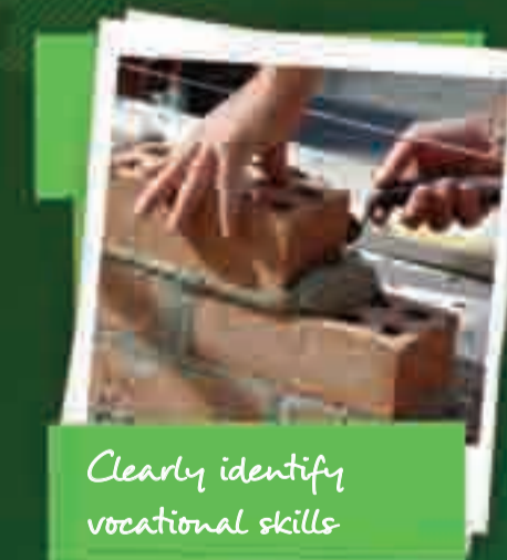
Clearly identify vocational skills