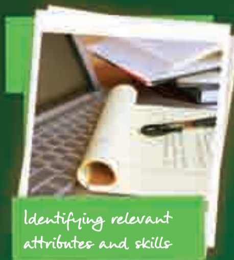
Identifying relevant attributes and skills

The Certificate Supplement is recognised across Europe and beyond. Employers and education institutions value further information on the qualification programme you have successfully completed.