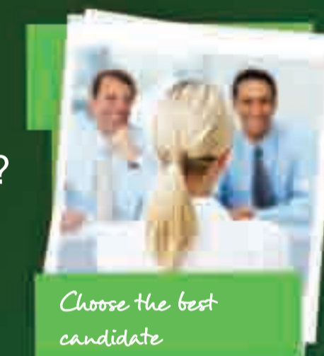
Choose the best candidate

As more and more graduates seek work outside of their own country, the Europass Certificate Supplement is increasingly used as a tool to provide a more comprehensive overview of the skills Vocational Education & Training (VET) graduates have obtained and the level of their qualification. This helps employers to choose the best candidate for any given position from a variety of backgrounds.