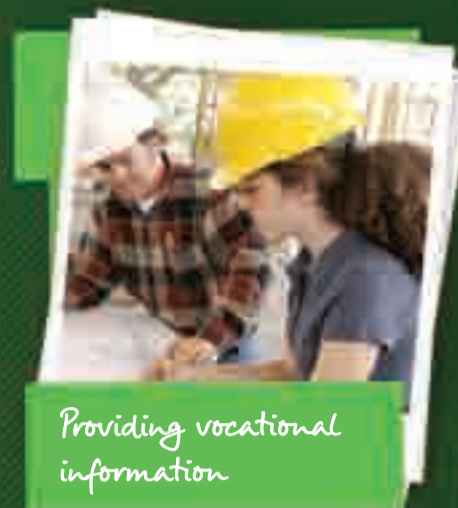
Providing vocational information

If you were not issued with a Certificate Supplement on completion of your vocational qualification, please contact your awarding body to find out more.