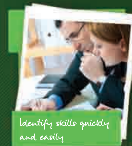
Identify skills quickly and easily